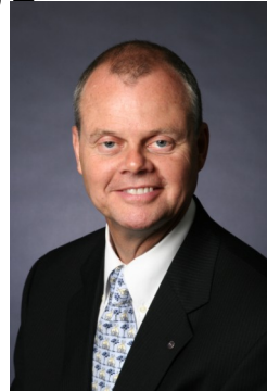
Tom Thorfinnson Bio on Page 8