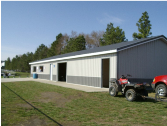
Rotary Concession Stands in Mobridge.