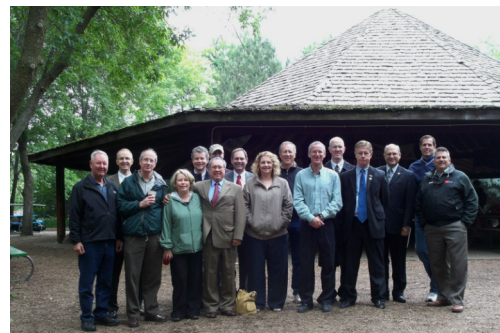
The other is a group of Rotary North Members- we had our regular Rotary meeting offsite at the YMCA a couple of weeks ago.