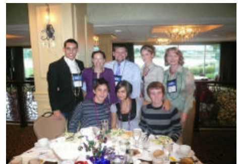
To the right: Skiing Above: at the District Conference.