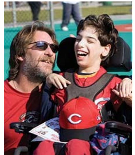
Thank you for helping change the world.