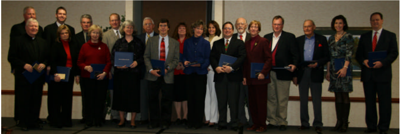
The Sioux Falls Rotary Club has 20 first time Paul Harris members at their Christmas Program on December 17th